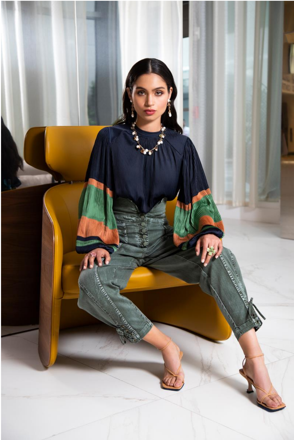
Top and pants by Ulla Johnson and shoes by Jeffrey Campbell @ Nordstrom, Aventura Mall. Jewelry by Diamonds On The Key.