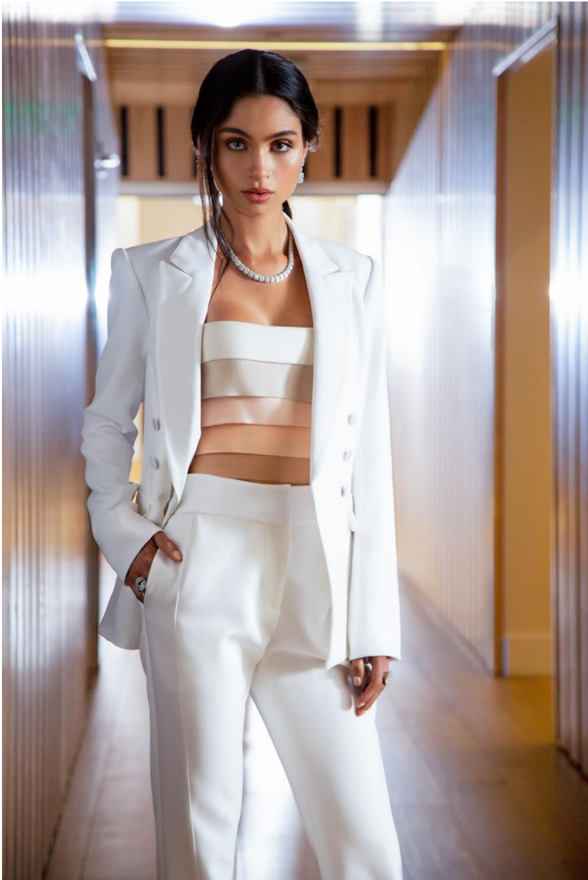
White suit by Jonathan Simkhai @ Nordstrom, Aventura Mall. Cropped top by LOLITTA. Jewelry by Diamonds On The Key.