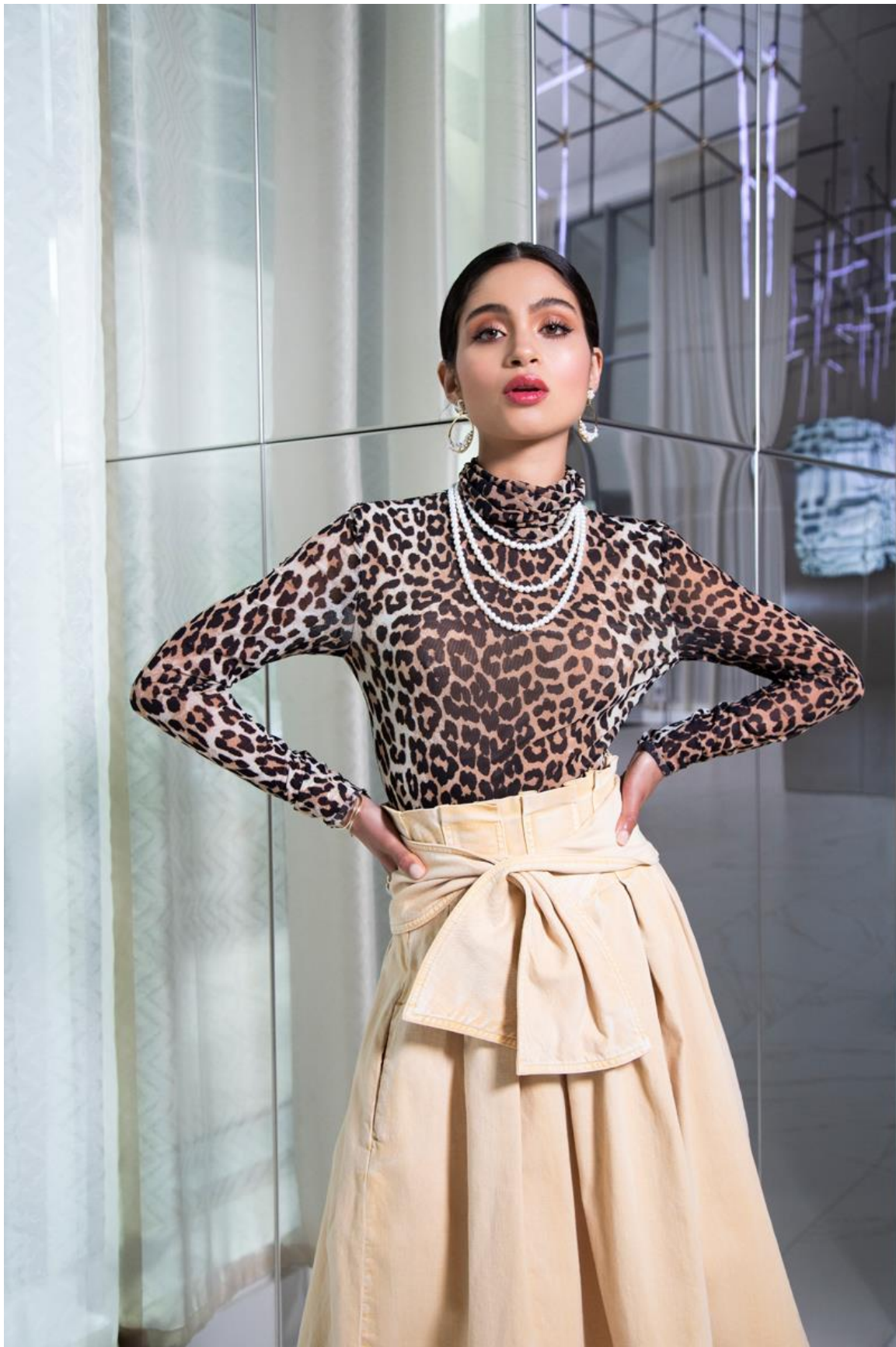
Top by Ganni and skirt by Ulla Johnson @ Nordstrom, Aventura Mall. Jewelry by Diamonds On The Key.