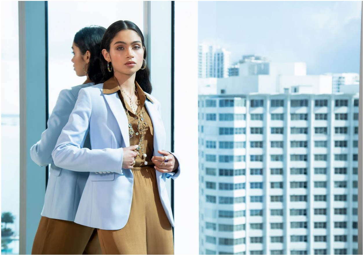
Jacket by Veronica Beard and top & pants by Vince @ Nordstrom, Aventura Mall. Jewelry by Diamonds On The Key.