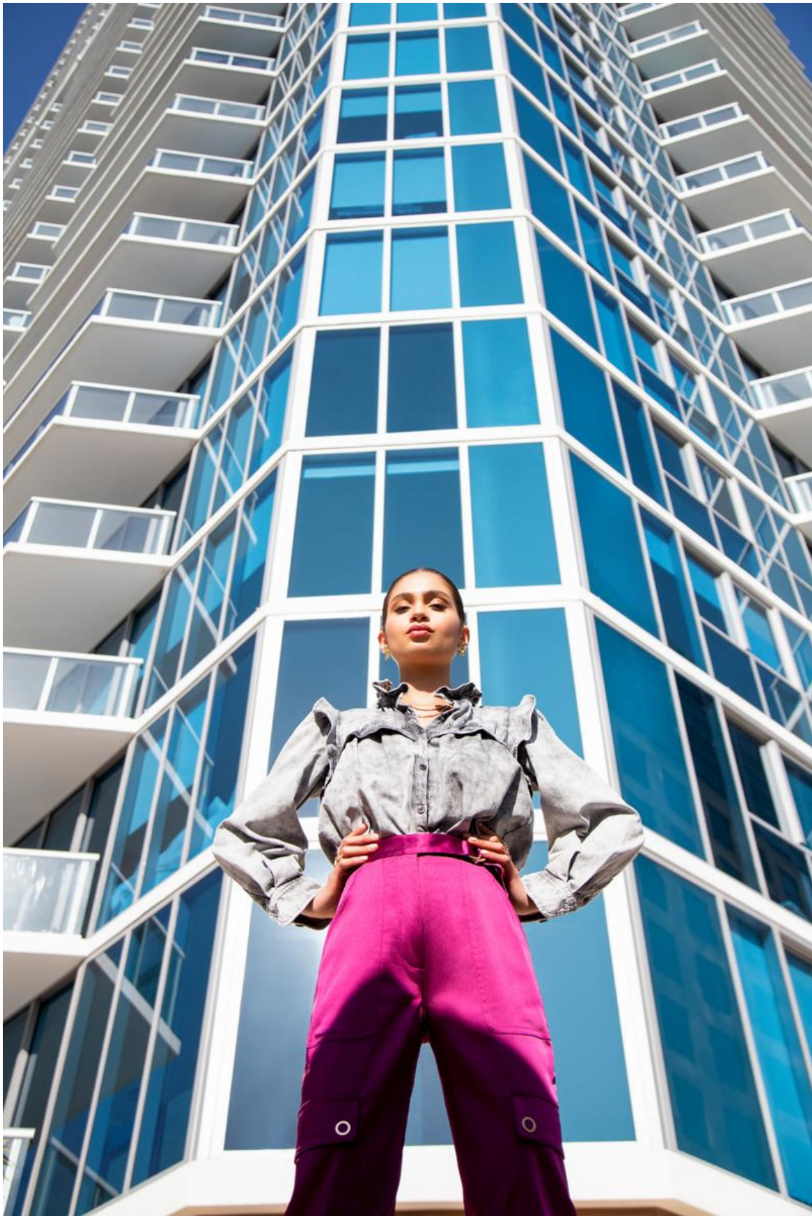
Shirt by Isabel Marant and pants by Jonathan Simkhai @ Nordstrom, Aventura Mall. Jewelry by Diamonds On The Key.