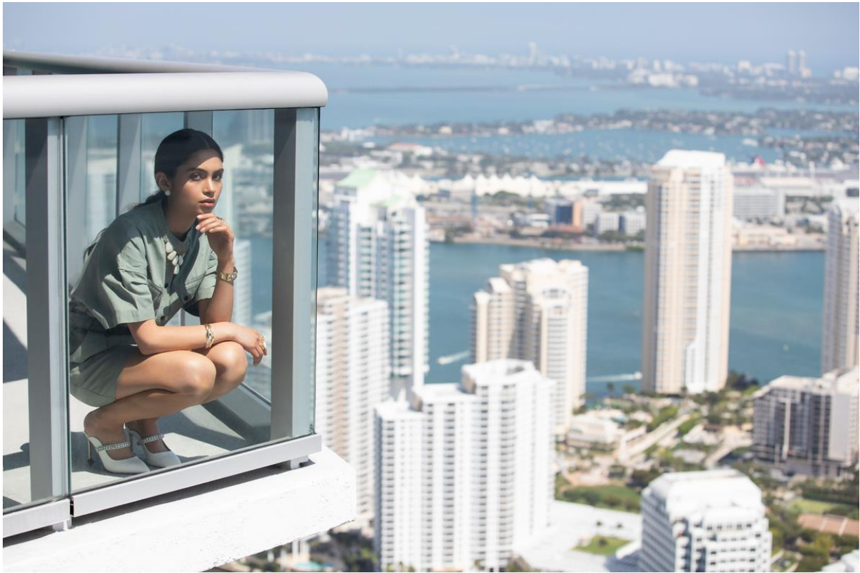
Dress by Isabel Marant and shoes by Kurt Geiger London @ Nordstrom, Aventura Mall. Jewelry by Diamonds On The Key.