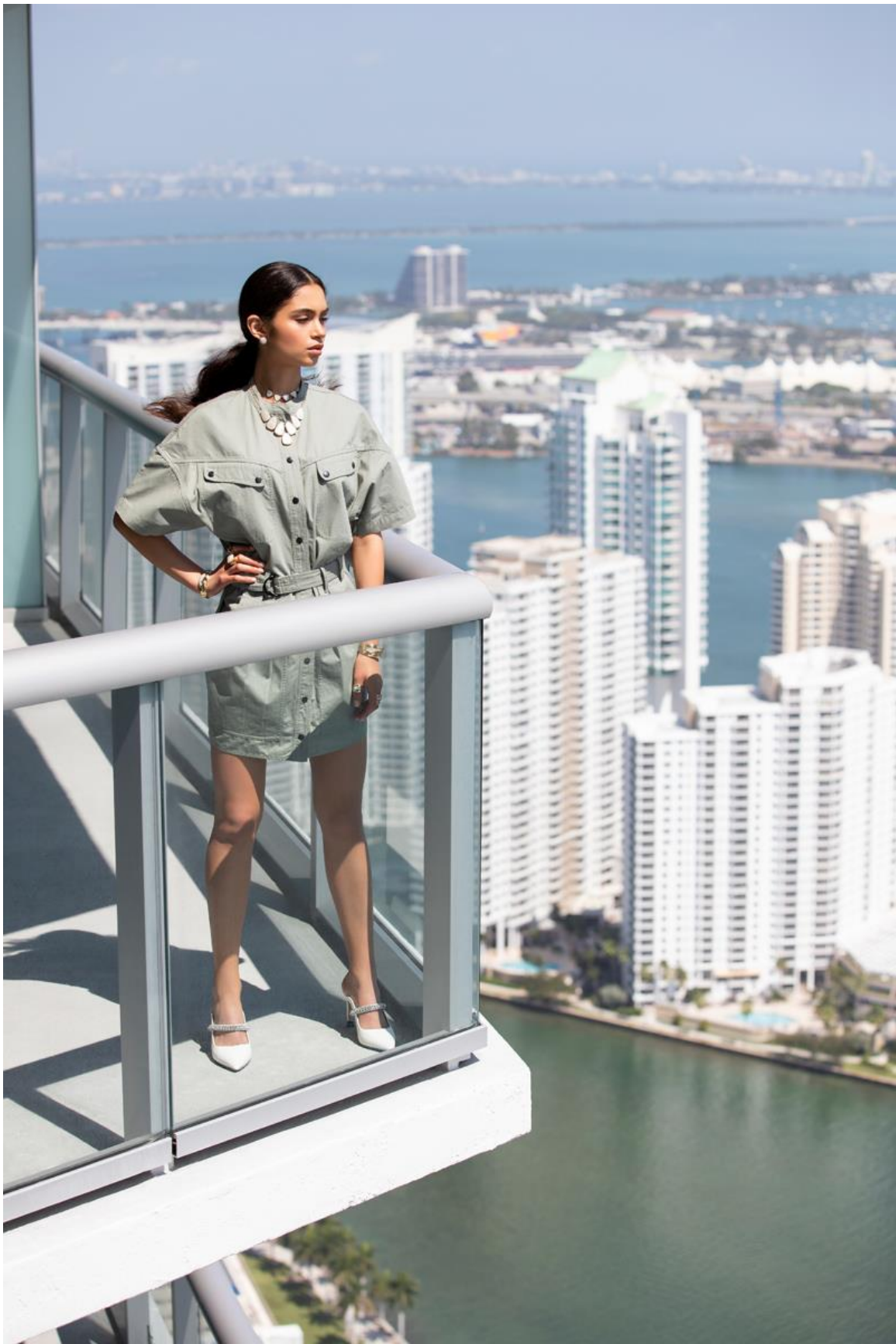
Dress by Isabel Marant and shoes by Kurt Geiger London @ Nordstrom, Aventura Mall. Jewelry by Diamonds On The Key.