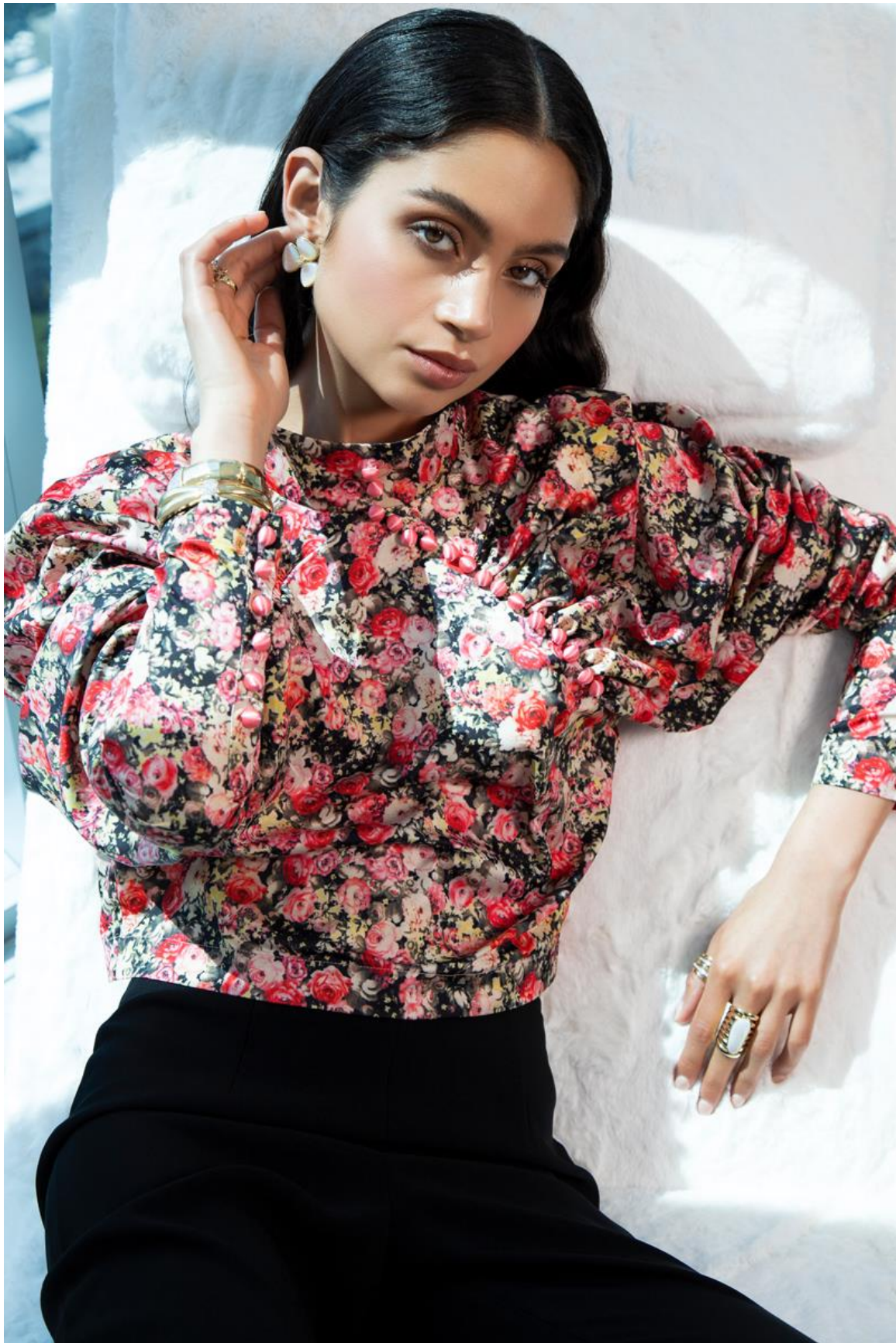
Shirt by ROTATE and pants by Cinq à Sept @ Nordstrom, Aventura Mall. Jewelry by Diamonds On The Key.